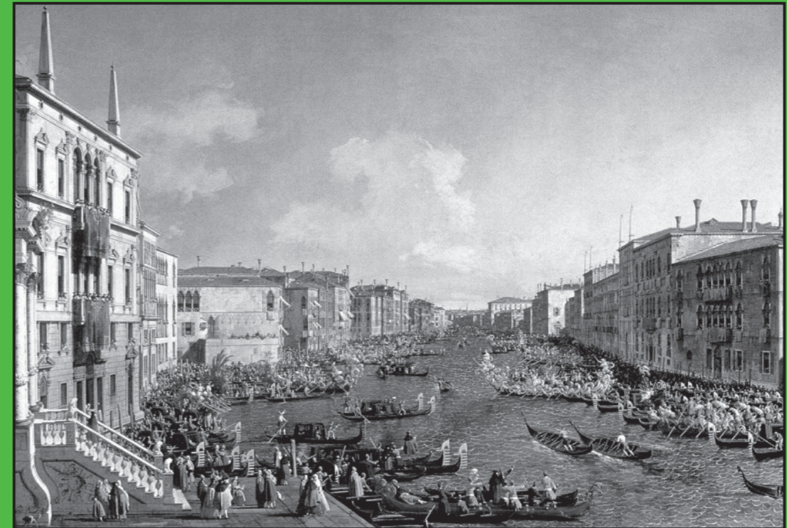
Giovanni Antonio Canal (detto Canaletto), Regata sul Canal Grande, 1732

NEW, SAFE AND EFFECTIVE NATURAL PRODUCTS FOR COMMON DERMATOLOGIC CONDITIONS